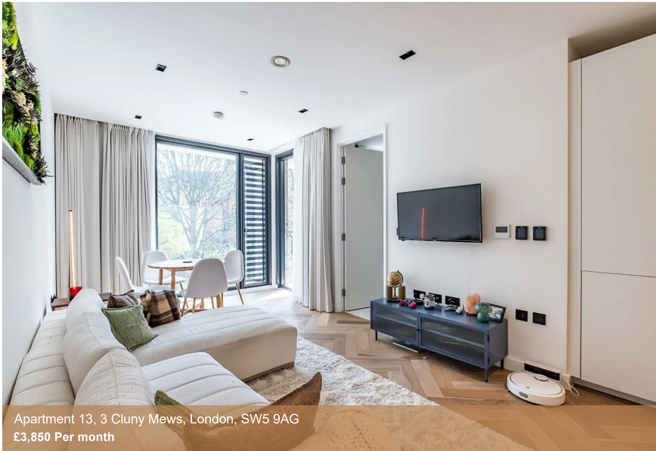
Apartment 13, 3 Cluny Mews, London, SW5 9AG £3,850 Per month